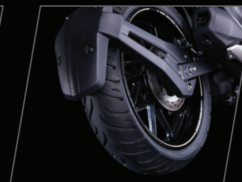
140mm WIDE RADIAL TYRE