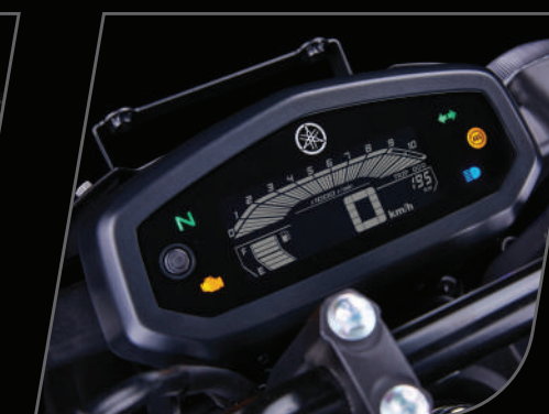
NEGATIVE LCD DISPLAY