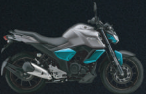
GRAY AND CYAN BLUE