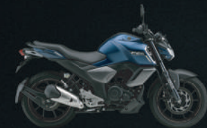
DARK MATT BLUE