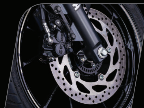
FRONT 1 ch ABS